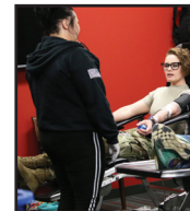
AMDS conducts blood drive

445TH AIRLIFT WING/PA BUILDING 4014, ROOM 113 5439 MCCORMICK AVE WRIGHT-PATTERSON AFB OHIO 45433-5132