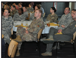
445th Airmen attend Armed Forces Day Luncheon